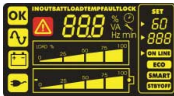
Display LCD custom

SUITABLE FOR EMERGENCY LIGHTING APPLICATIONS